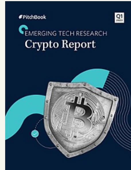
Q1 2023 Crypto Report