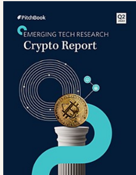
Q2 2023 Crypto Report